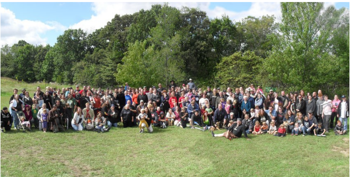
200 of the 240 heathens who attended Lightning Across the Plains 2010

To visit the public Yahoo e-list for the Regional Midwest Thing, click here .