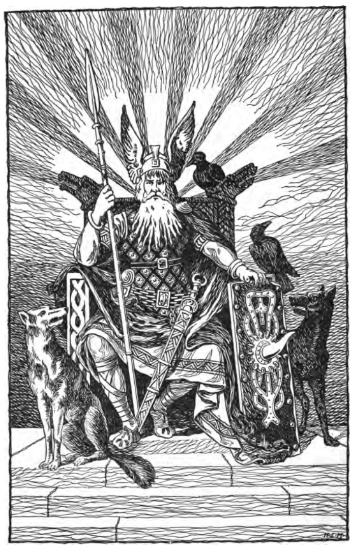
ODIN, THE ALLFATHER.