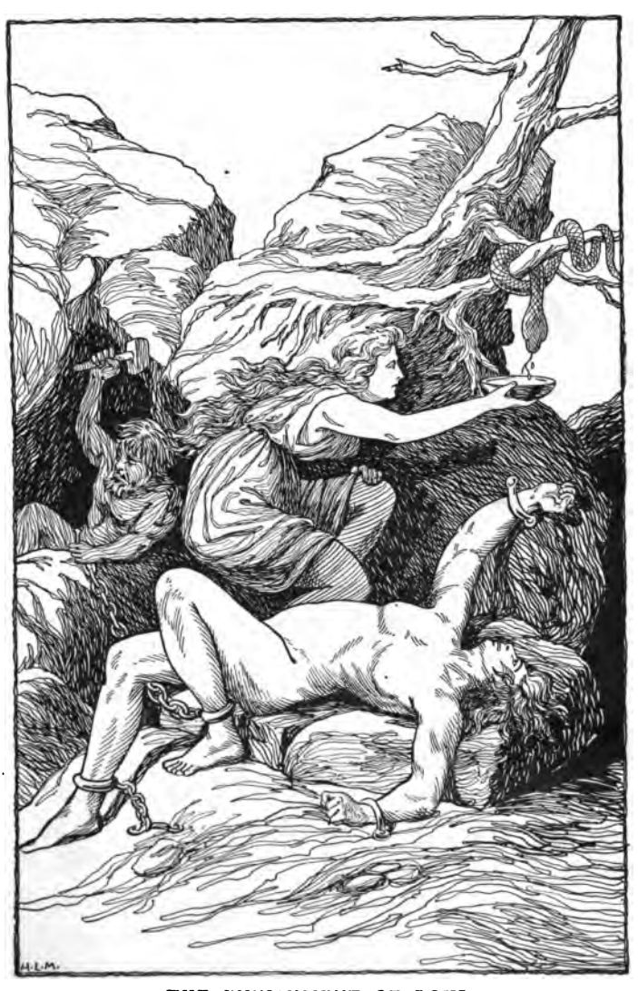
THE PUNISHMENT OF LOKL