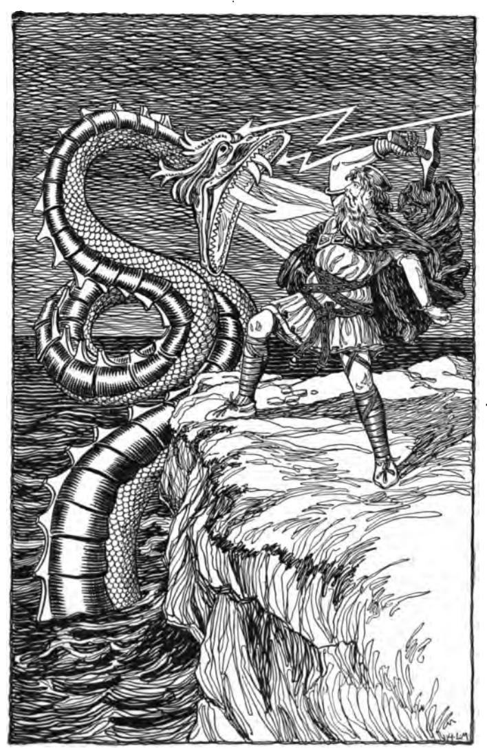
THOR FIGHTING THE SERPENT.