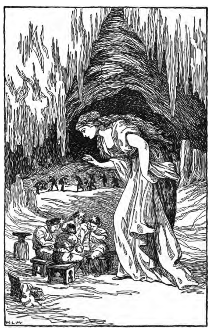
FREYJA IN THE CAVE OF THE DWARFS.