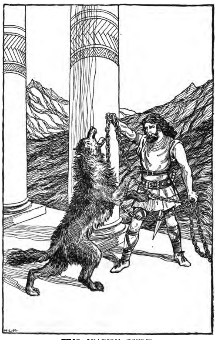
THOR CHAINING FENRIR.