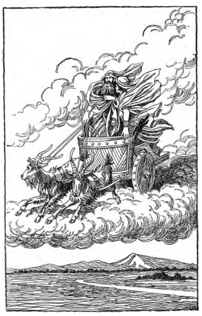
THOR AND LOKI IN THE CHARIOT.