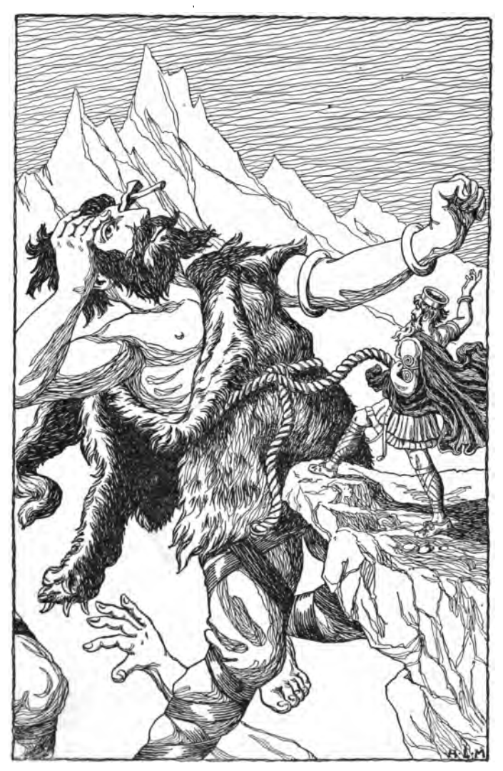
THOR'S BATTLE WITH THE FROST GIANTS.