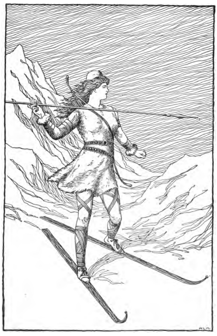
SKADI HUNTING IN THE MOUNTAINS.