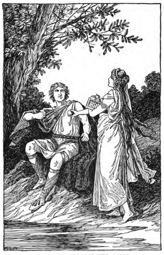
IDUNA GIVING LOKI THE APPLE.