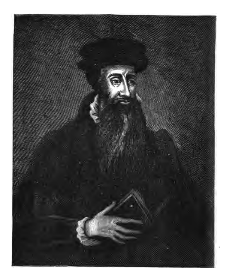
THE TORPHICHEN PORTRAIT.