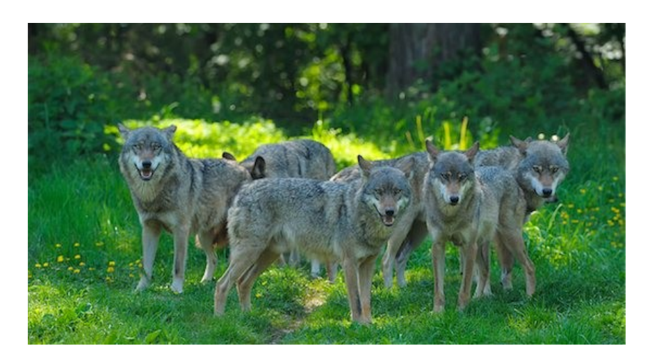
- Based on Stanza 21 of the Hávamál -

As it is with sheep, it is also with men...the foolish man never knows how much to eat.